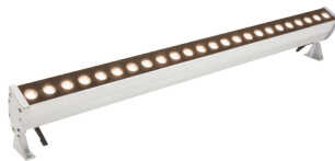
LLW32-WW LED Linear - 32 32W / 1700Lm 31.5"L x 2-3/16"W x 5"H