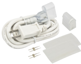
P2-NF-CONKIT-8A 120V power connection kit Includes: (1) 120V AC 5ft power cord with 8A inverter, (1) power pin, (1) end cap and (2) 4" sections of shrink tube