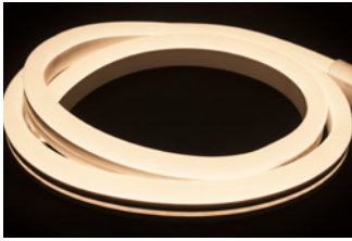
P2-NF-WW (120V) P2-NF-24V-WW (24V) Warm White LEDs Opaque white jacket 3000K • 79CRI • 52Lm/ft