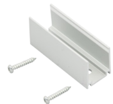
PLR-NF-CLIPS 2" aluminum mounting clips with (2) mounting screws