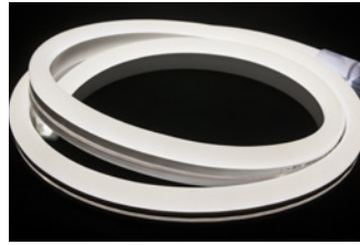
P2-NF-WH (120V) P2-NF-24V-WH (24V) Bright White LEDs Opaque white jacket 5000K • 78CRI • 58Lm/ft