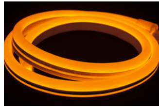
P2-NF-OR (120V) P2-NF-24V-OR (24V) Orange LEDs Opaque amber jacket 610nm • 15Lm/ft