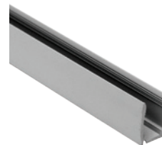
P2-NF-CHAN-1M 3ft aluminum mounting track 3/4"W x 3/8"H