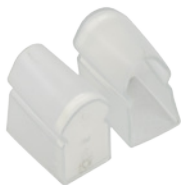
PLR-NF-ENDS Clear plastic end caps (10 per bag)