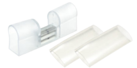
P2-NF-INVS Invisible splice kit Includes: (1) power pin and (2) 4" sections of shrink tube