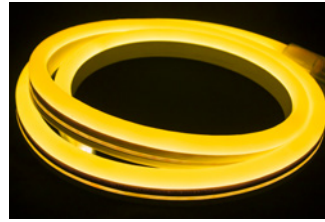
P2-NF-AY (120V) P2-NF-24V-AY (24V) Amber LEDs Opaque yellow jacket 565nm • 6Lm/ft