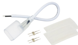
P2-NF-CONKIT-NP 24V power connection kit Includes: (1) 5ft power cord (without plug, without inverter), (1) power pin, (1) end cap and (2) 4" sections of shrink tube