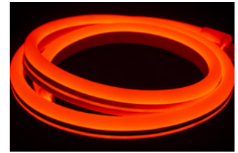
P2-NF-RE (120V) P2-NF-24V-RE (24V) Red LEDs Opaque red jacket 625nm • 6Lm/ft