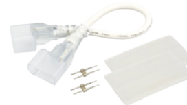
P2-NF-JUMP5 6" cable P2-NF-JUMP3 3ft cable P2-NF-JUMP10 10ft cable P2-NF-JUMP20 20ft cable Jumper (linking) cables Includes: (2) power pins and (2) 4" sections of shrink tube