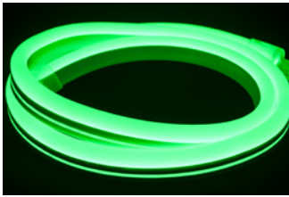
P2-NF-GR (120V) P2-NF-24V-GR (24V) Green LEDs Opaque green jacket 520nm • 25Lm/ft