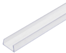
H2-TRACK-3 3ft clear plastic mounting track 23/32" w x 13/32" h