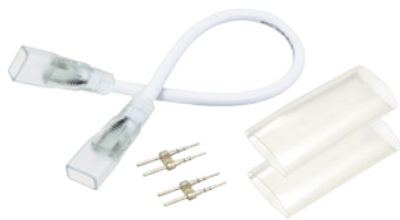
H2-JUMP.5 6" cable H2-JUMP3 3ft cable H2-JUMP10 10ft cable H2-JUMP20 20ft cable Jumper (linking) cable Includes: (2) pin connectors and (2) 4" sections of shrink tube