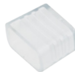
H2-ENDS Clear plastic end caps, bag of 10