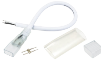
H2-CONKIT-NP 24V power connection kit Includes: (1) 5ft power cord (without plug, without inverter), (1) power pin, (1) end cap and (2) 4" sections of shrink tube