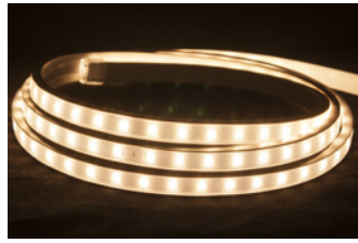
120-H2-WW (120V) 24-H2-WW (24V) 150ft reel • 2700K Warm White LEDs (120V) 82CRI • 145Lm/ft (24V) 82CRI • 195Lm/ft