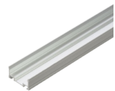
H2-CHAN-3 3ft aluminum mounting track 23/32" w x 13/32" h