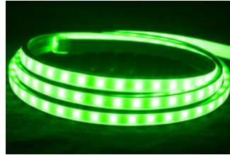
120-H2-GR (120V) 24-H2-GR (24V) 150ft reel, Green LEDs (120V) 520nm • 100Lm/ft (24V) 520nm • 140Lm/ft