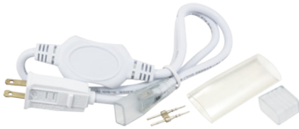
H2-CONKIT-8A 120V power connection kit Includes: (1) 120V AC 5ft power cord with 8A inverter, (1) power pin, (1) end cap and (2) 4" sections of shrink tube