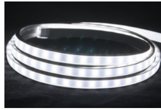
120-H2-WH (120V) 24-H2-WH (24V) 150ft reel • 5000K Bright White LEDs (120V) 82CRI • 180Lm/ft (24V) 82CRI • 230Lm/ft