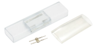
H2-SPL Splice kit Includes: (1) connection sleeve assembly, (2) power pins and (2) 3" sections of shrink tube