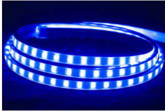
120-H2-BL (120V) 24-H2-BL (24V) 150ft reel • Blue LEDs (120V) 465nm • 25Lm/ft (24V) 465nm • 35Lm/ft